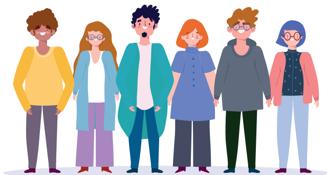
Illustrations from vecteezy.com