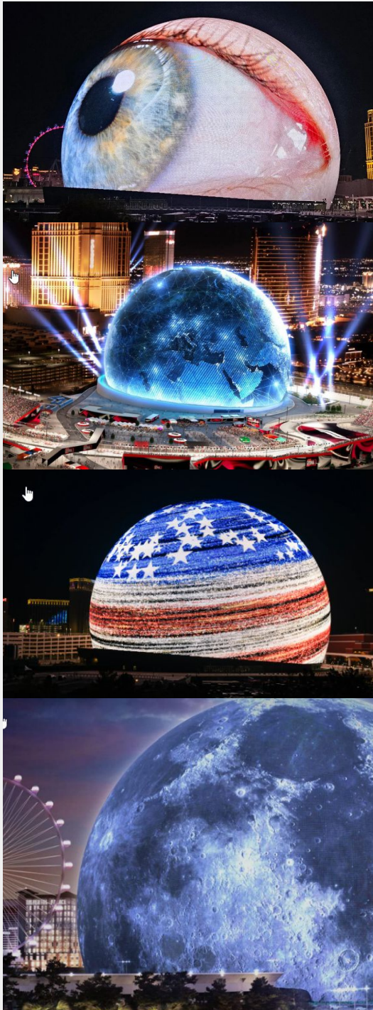
The Las Vegas "Sphere"